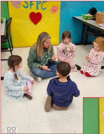
VBS Pop-Up activities were enjoyed on Sunday, 2/16. Kids Kindness Night was the theme!